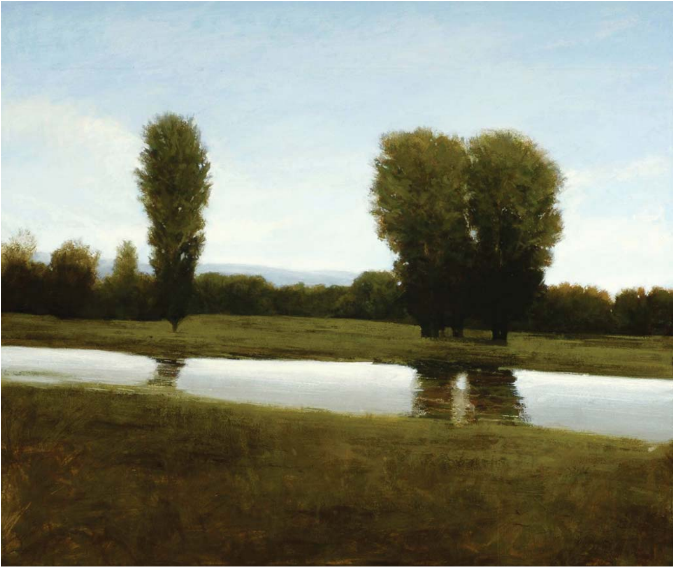
Andrzej Skorut , Spring with Stream , oil, 38 x 45"